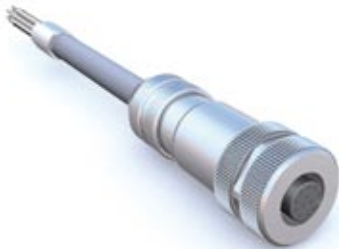
Type of connection GE